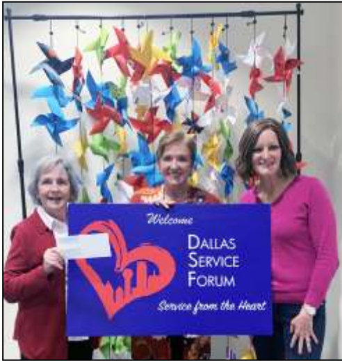
Dallas Childrens Advocacy