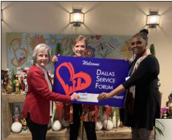
Ronald McDonald House Dallas