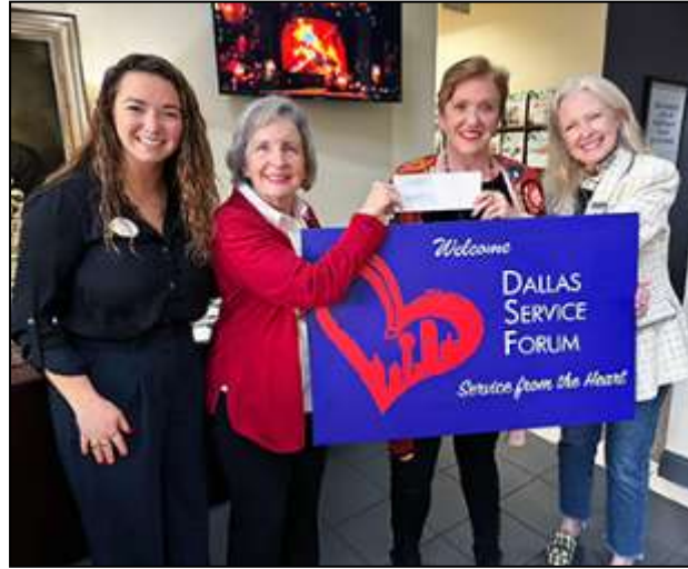
Juliette Fowler/Ebby House